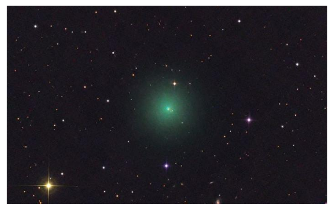
Comet C/2017 O1 (ASASSN) was discovered on July 19 displaying already a large diffuse gas coma in the following days. This color image was taken by Rolando Ligustri on July 27, the green color of the coma is due to the presence of strong C_2 emission bands in the spectrum.

Comet C/2017 O1 (ASASSN) is a new good interesting target well placed for northern observers. Inner forecasts predicts that the total magnitude should peaks around 8 around perihelion in mid October. But its behavior is very uncertain because the comet, close to magnitude 15 at the discovery, displayed some moderate amplitude outbursts, and very likely it was also in outburst at the discovery between July 19 and 22.